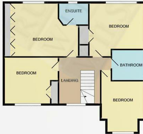
1ST FLOOR APPROX. FLOOR AREA 755 SQ.FT. (70.1 SQ.M.) TOTAL APPROX. FLOOR AREA 1924 SQ.FT. (178.7 SQ.M.)

Whilst every attempt has been made to ensure the accuracy of the floor plan contained here, measurements of doors, windows, rooms and any other items are approximate and no responsibility is taken for any error, omission, or mis-statement. This plan is for illustrative purposes only and should be used as such by any prospective purchaser. The services, systems and appliances shown have not been tested and no guarantee as to their operability or efficiency can be given.