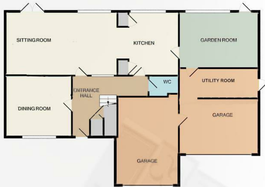
GROUND FLOOR APPROX. FLOOR AREA 1169 SQ.FT. (108.6 SQ.M.)